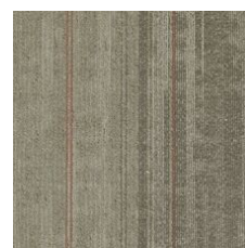
Smoky Quartz 14761